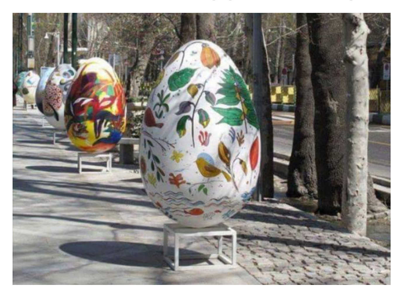
20 Eggs for Paintings – Suggested date – 2 May