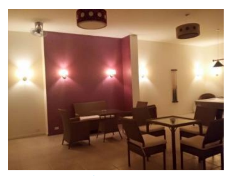
20 Sets –Sofa + 4 Chairs + 1 Table