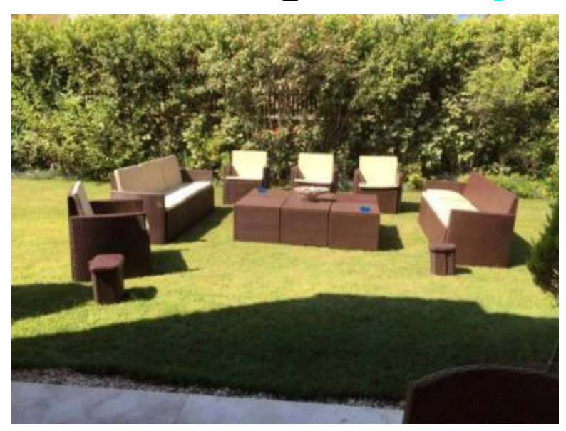
20 Sets—Big Sofa + 2 Chairs + 2 Small Tables