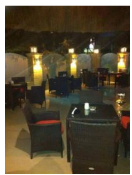
20 Sets- 4 Chairs + 1 Table